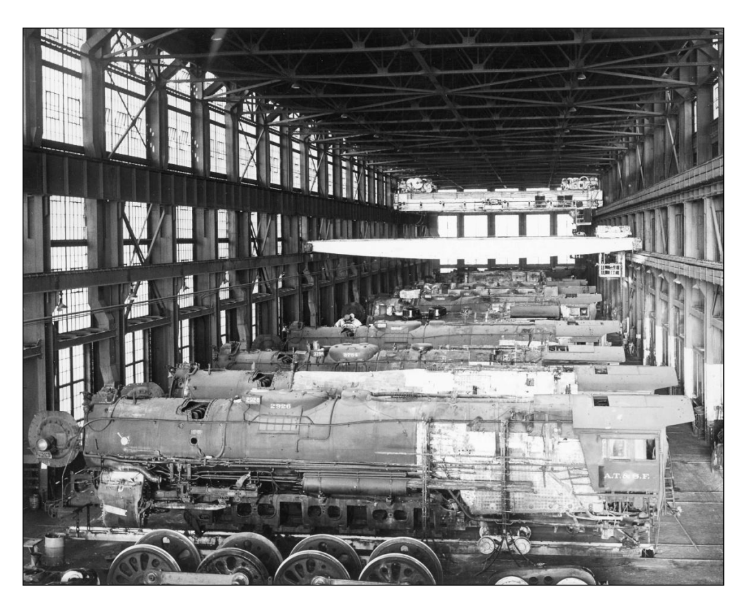
Figure 1 Steam Locomotives Undergoing Major Overhauls in Erecting Shop circa 1953

It has been the WHEELS' dream and vision to utilize all or a significant portion of the 27 acre site and its vacant historic large buildings for the purpose of creating a world-class transportation museum.