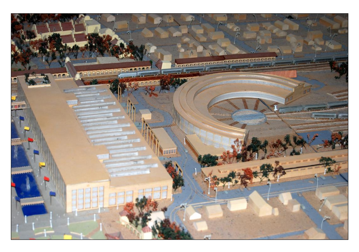
Figure 16 Model of Rebuilt Roundhouse as part of WHEELS Museum Credit VOA Architects