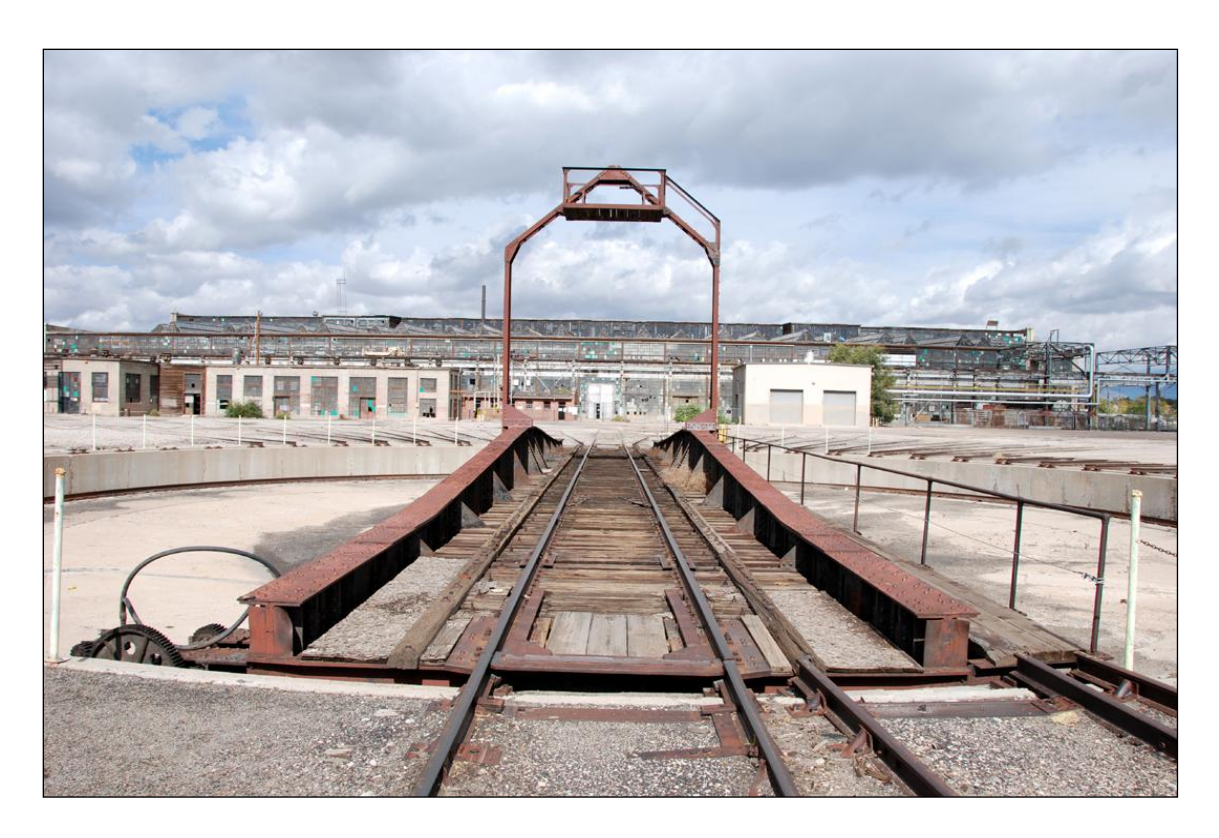
Figure 15 Working Rail Yards turntable with vacant Erecting/Machine Shop in the background

One of the significant components of The WHEELS Museum is the built from scratch exact replica of the demolished roundhouse located precisely where it stood with the working turntable as the center piece. While the roundhouse exterior would look as it did during the working era, the WHEELS Museum roundhouse would be constructed of all new material, as green as practical, and with a purpose partially fulfilling the need for steam and Diesel locomotive and car maintenance, but primarily as new space for exhibits, classrooms, etc. There are many benefits: