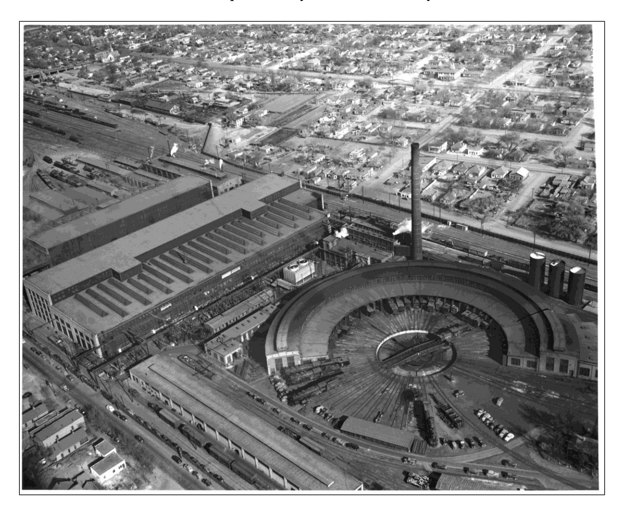
Figure 14 The Albuquerque Roundhouse during the peak era of steam locomotive maintenance. The roundhouse was demolished in 1986 but the turntable is still functional and in use by the BNSF Railway.

A critical component of every working rail yard during the age of steam locomotives was the roundhouse which was a structure designed around a turntable for spotting locomotives in stalls for routine maintenance. The rail yards in Albuquerque had a very large roundhouse which the Santa Fe Railway demolished in 1986. However, the turntable still exists and is in frequent use by the BNSF Railway.