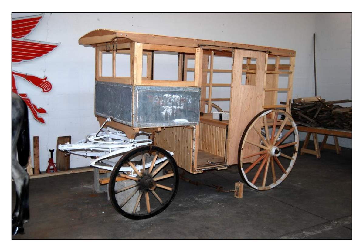
Figure 5 Horse Drawn Milk Delivery Wagon from Corrales, NM under Restoration