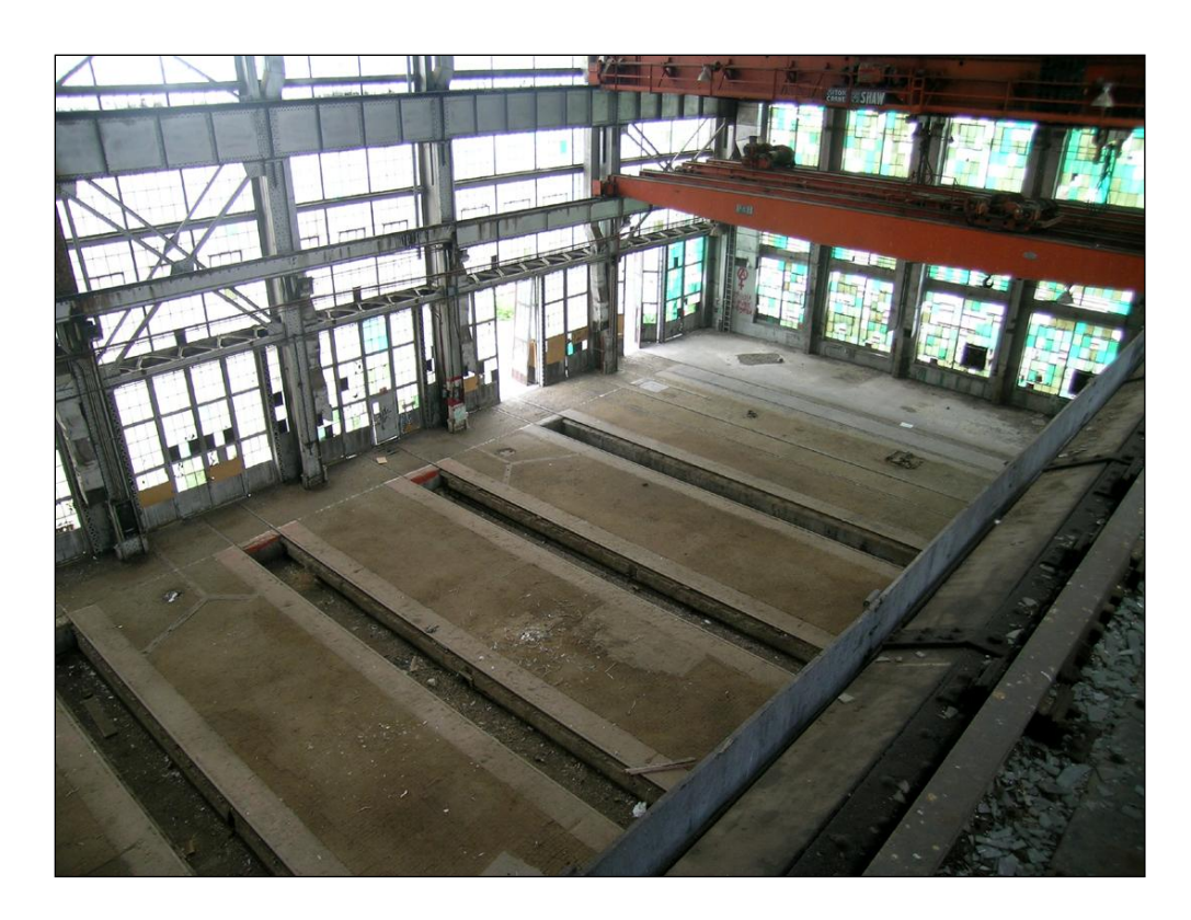
Figure 2 Vacant Erecting Shop Today – Note Intact 250 Ton Overhead Crane