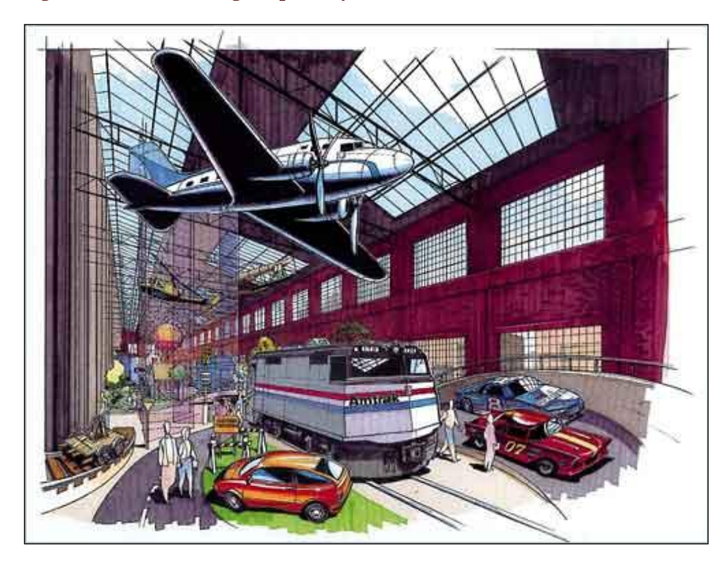
Figure 3 Artist's Concept with Major Displays in Erecting Shop Credit North Carolina Transportation Museum