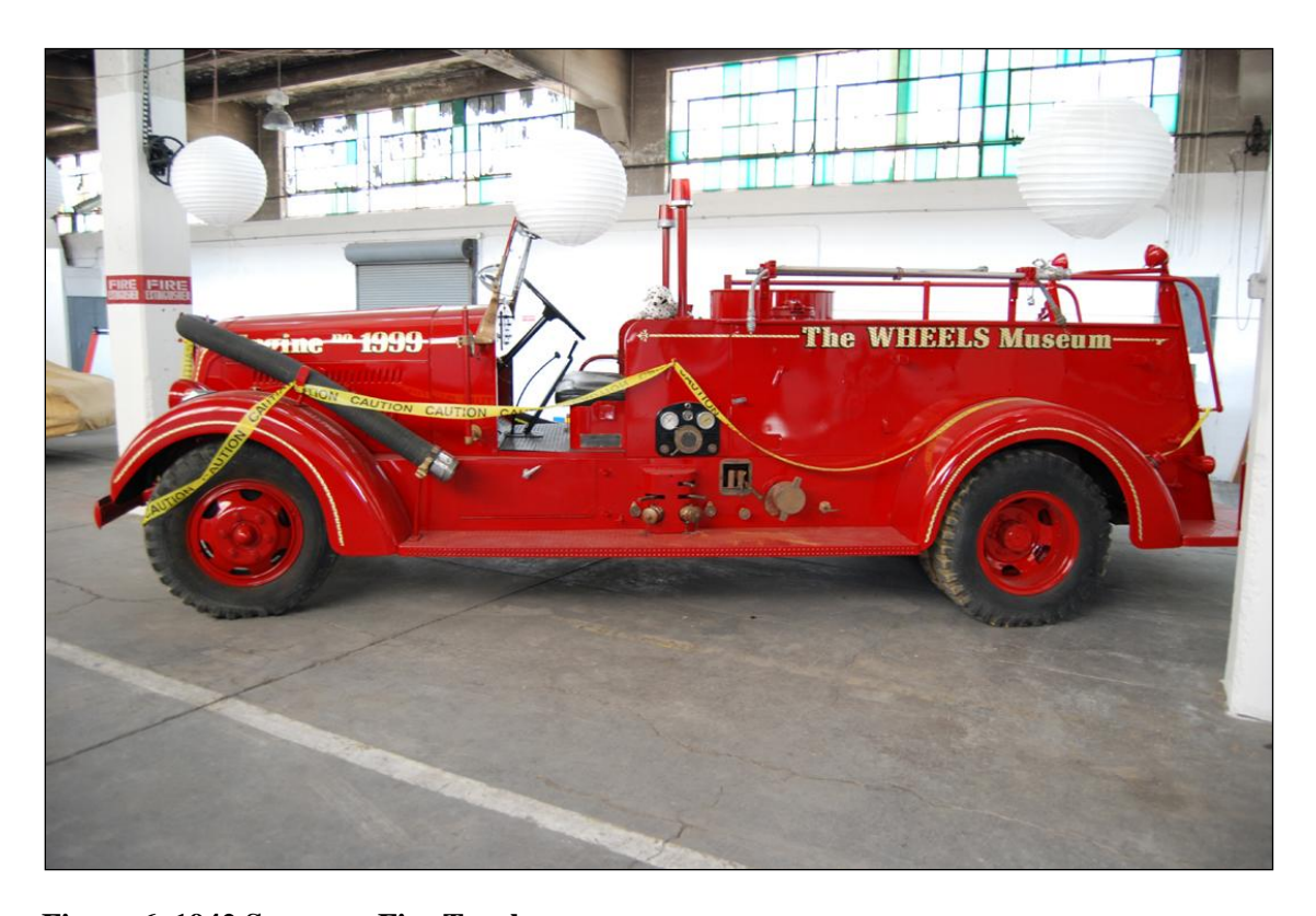
Figure 6 1942 Seagrave Fire Truck