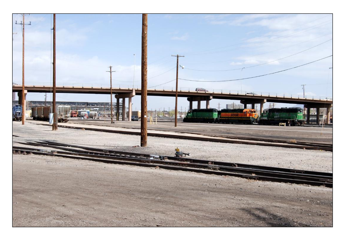
Figure 11 South Boundary of Rail Yards is BNSF Railway Property including Locomotive Storage and Switching