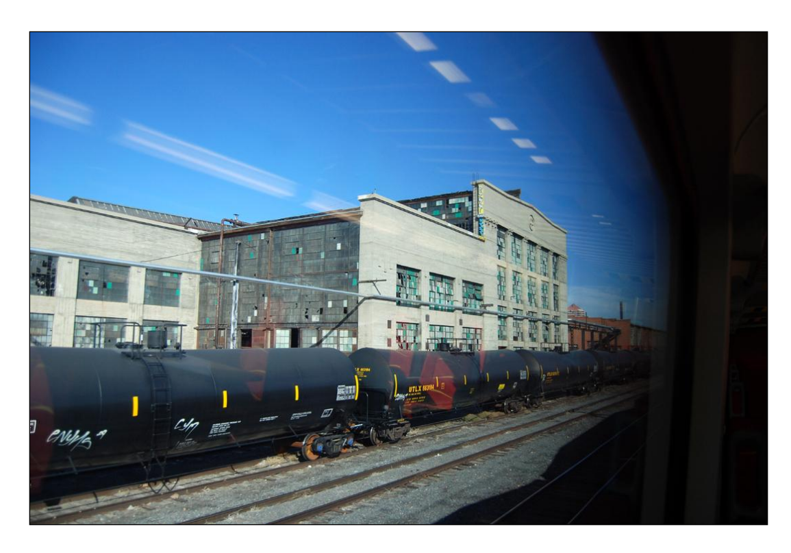
Figure 9 East Boundary of Rail Yards Consists of Active Tracks for BNSF Freight