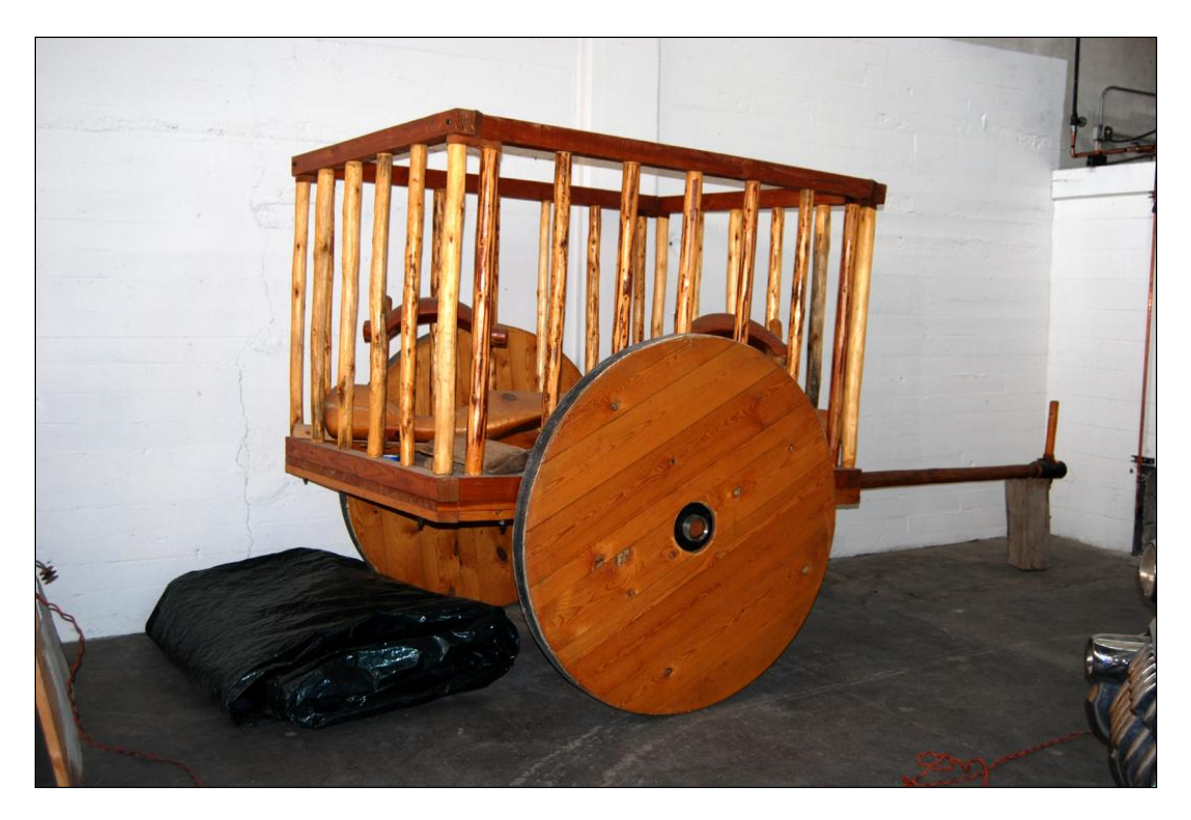
Figure 4 Replica Carreta (Ox Cart) Donated to WHEELS Representing the Earliest Form of Wheeled Transportation in New Mexico

The WHEELS Museum expects to receive significant artifact donations as space becomes available and restoration efforts proceed with artifacts ranging from historical locomotives to automobiles and to light aircraft. With the residency of the WHEELS Museum at the Rail Yards, the city of Albuquerque will experience tourism activities at all age levels and origins, with families, young and old, local, national and international tourists. The potential varied population visiting the site could spark immediate ancillary businesses in the vicinity. The WHEELS Museum itself will serve to embody historical innovations, including technologies, research and inventions that sprung forth from Albuquerque and New Mexico.