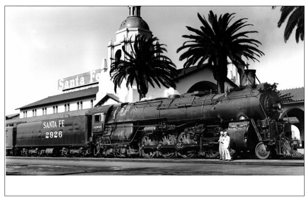
Figure 8 Santa Fe No. 2926 in San Diego in 1953 – Now Undergoing Restoration to Operating Condition and to be Based at WHEELS Museum

Steam locomotive ex-Santa Fe No. 2926 now undergoing restoration to operating status by the New Mexico Steam Locomotive & Railroad Historical Society will make the WHEELS Museum its home for display and operating base for regular passenger excursions. No. 2926 is over 120 feet long and weighs close to 1 million pounds. The size of No. 2926 is in keeping with other locomotives that will be on display and operation.