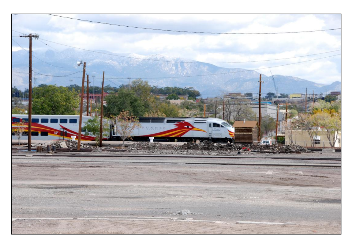
Figure 10 East Boundary of Rail Yards is also used by NM Rail Runner Express Commuter Trains \,