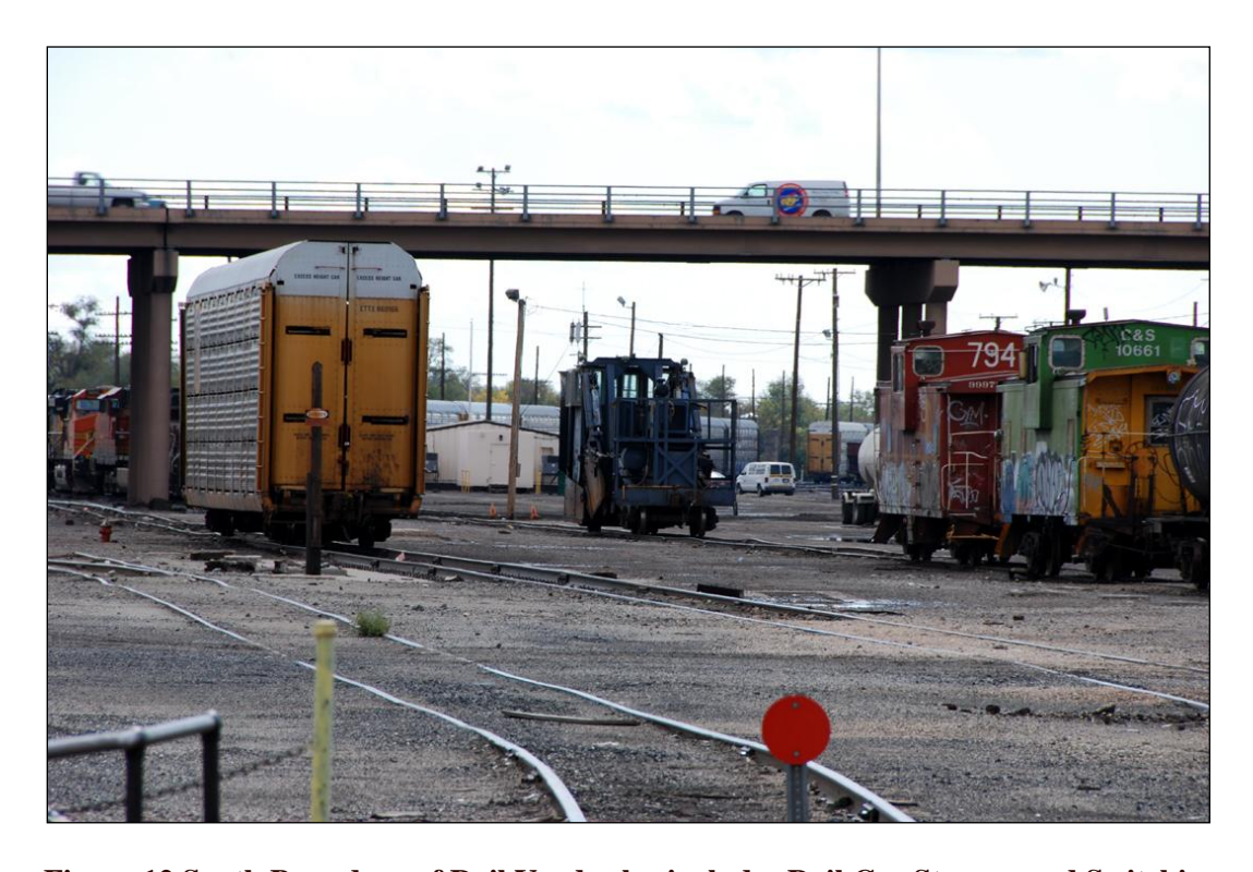
Figure 12 South Boundary of Rail Yards also includes Rail Car Storage and Switching